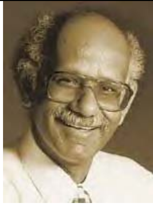
Sivasailam Thiagarajan Workshops by Thiagi